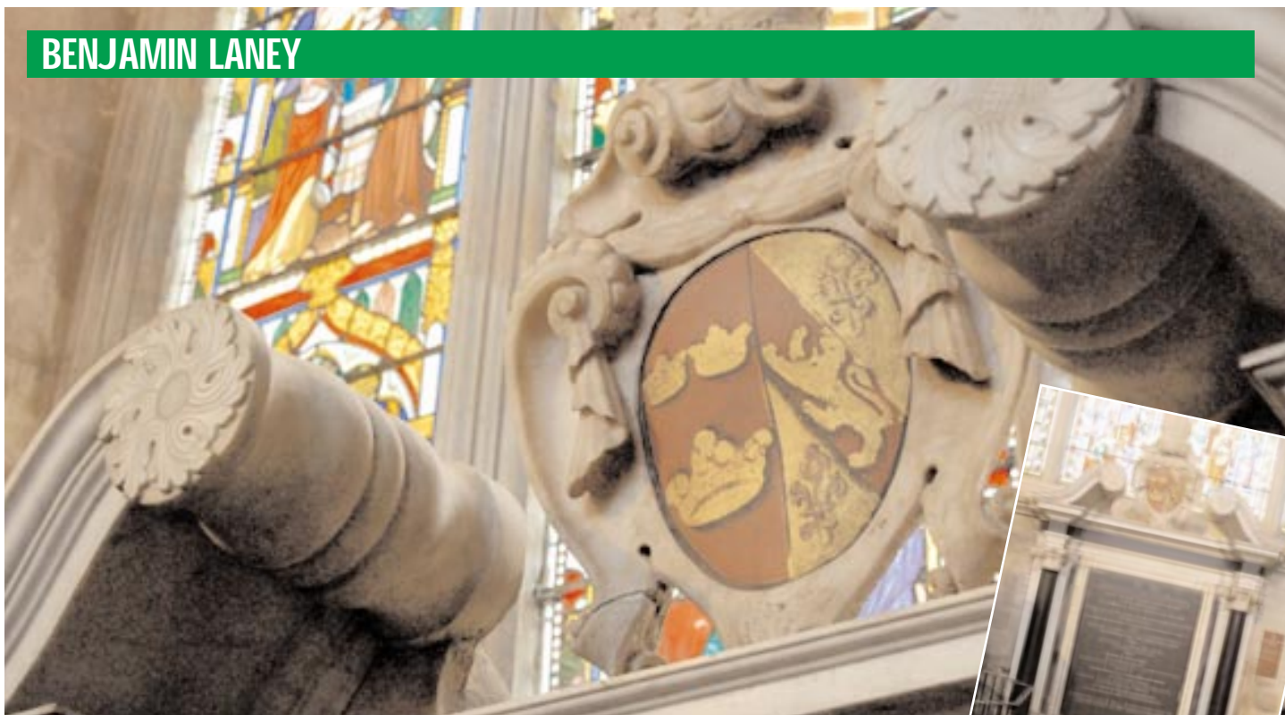
Position in Ely Cathedral of Monument - Left hand side wall by choir stalls before altar at East End.