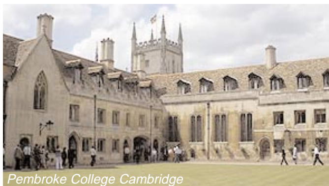
Pembroke College Cambridge

Six Trustees continue to action his will to this day. More information on land, rents and property can be found via the Soham Roots website.