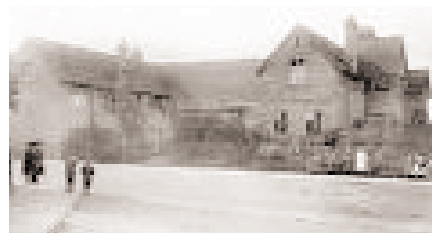
Top: The Old grammar School as it is today in a state of decay.